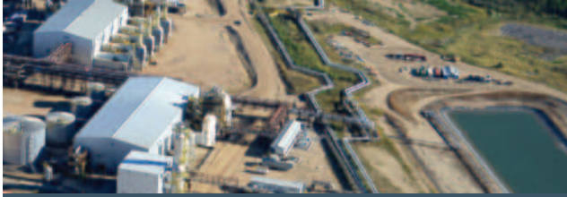
MEG Energy Christina Lake SAGD Post-Combustion CO 2 Capture Alberta, Canada