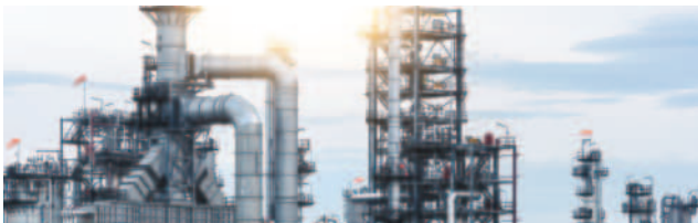
Gas Processing Facility Post-Combustion CO 2 Capture Alberta, Canada