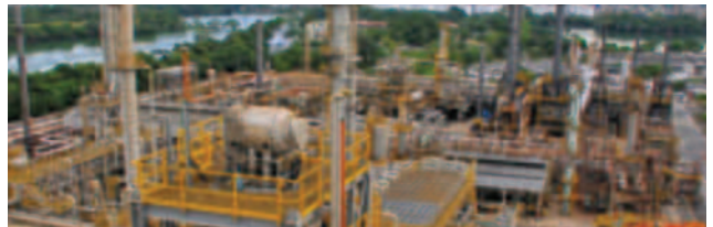
Ecopetrol Barrancabermeja Refinery Blue Hydrogen & Carbon Capture Colombia