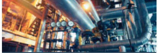
Carbon Capture Technology Landscape Study – Whitecap Resources Saskatchewan, Canada