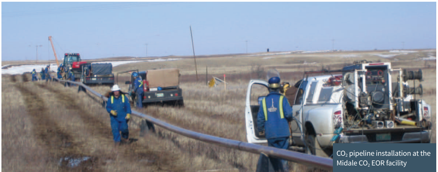
CO 2 pipeline installation at the Midale CO 2 EOR facility