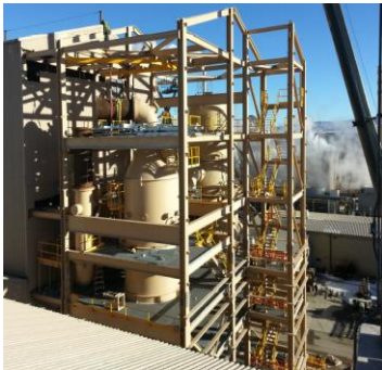
Phosphoric Acid Evaporator Design (above) and Installation (below) for Simplot in Rock Springs, Wyoming, USA