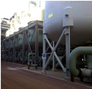
Evaporation Circuit at the Yarwun Alumina Refinery, in Gladstone, QLD Australia